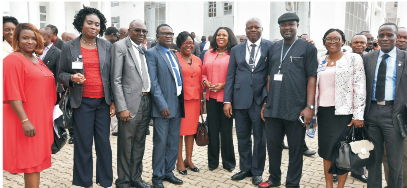
2018 Monitoring and Evaluation Workshop, 01 August 2018.