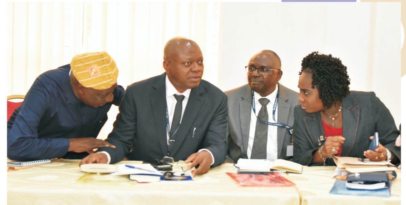
2018 Monitoring and Evaluation Workshop, 01 August 2018.