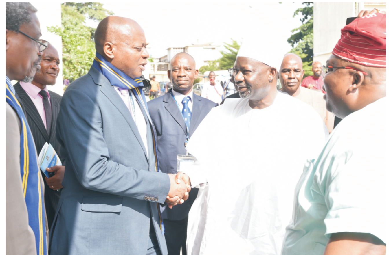
Courtesy visit by the Executive Governor of Gombe State, His Excellency, Alh. Ibrahim Hassan Dankwambo, OON

SOURCE: ACADEMIC PLANNING UNIT, UNIVERSITY OF IBADAN