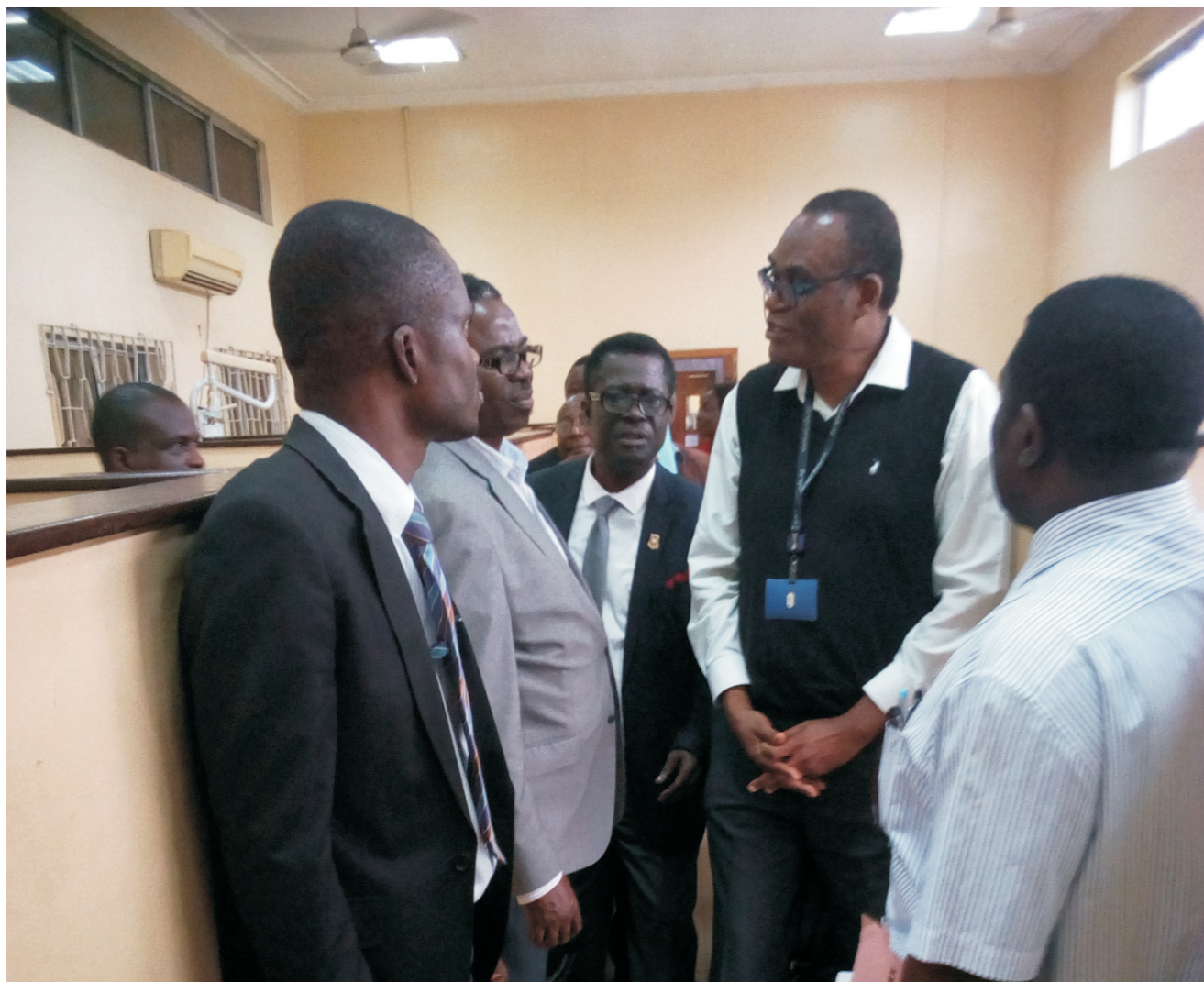
Mock Accreditation Committee at the Faculty of Dentistry, College of Medicine UI

Below is the list of academic programmes in the University of Ibadan and the year that they are due for accreditation.