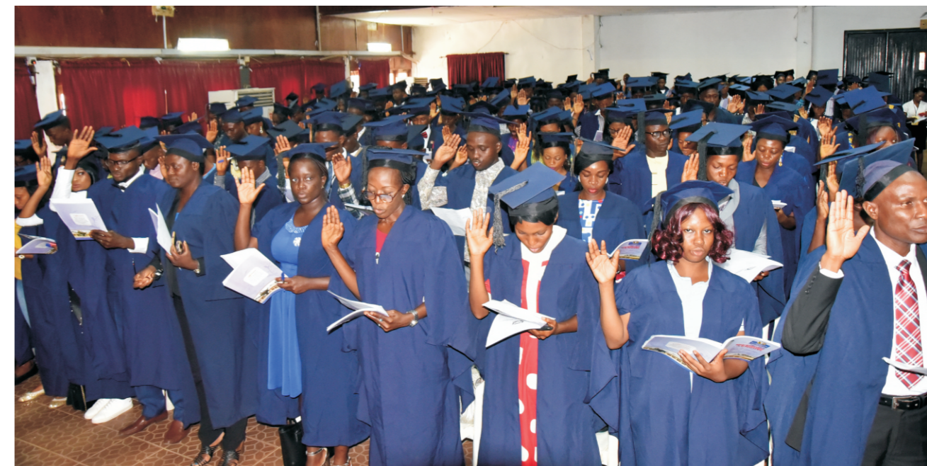
DLC 2018 Matriculation