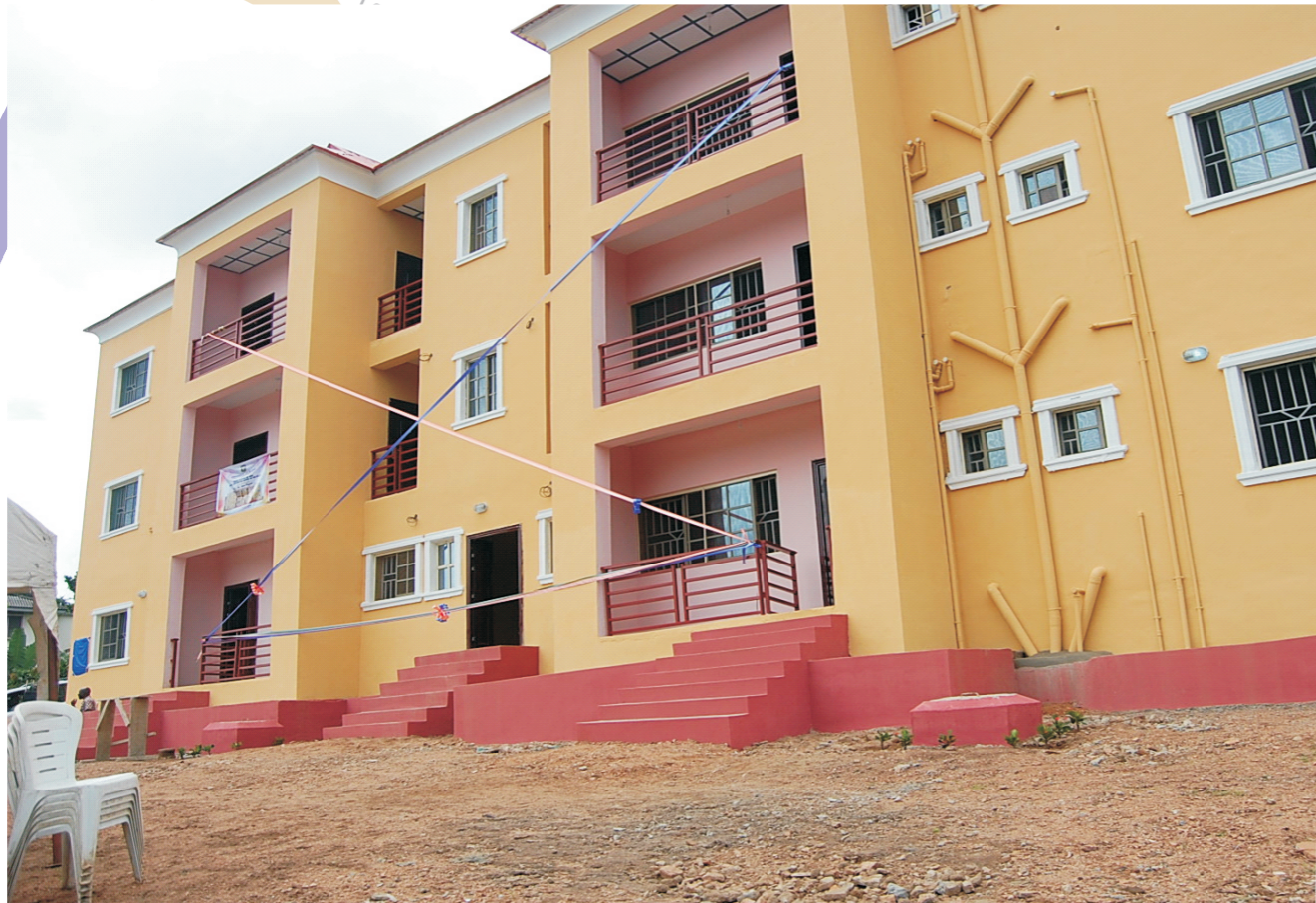
NEWLY BUILT BLOCK OF SIX FLATS BY UNIVERSITY HOUSING UNIT (FRONT VIEW)