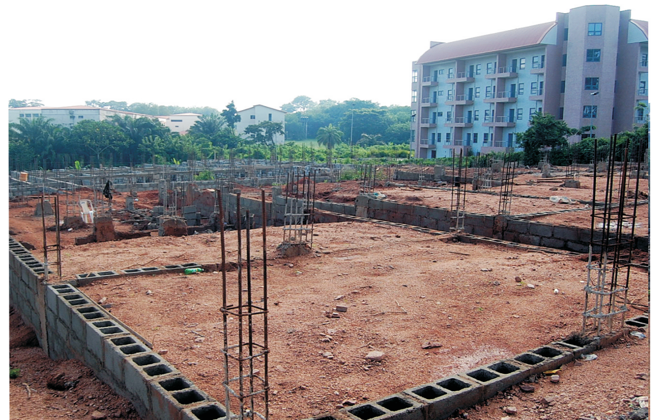
ONGOING CONSTRUCTION OF 77 PALMS PRIVATE HOSTEL