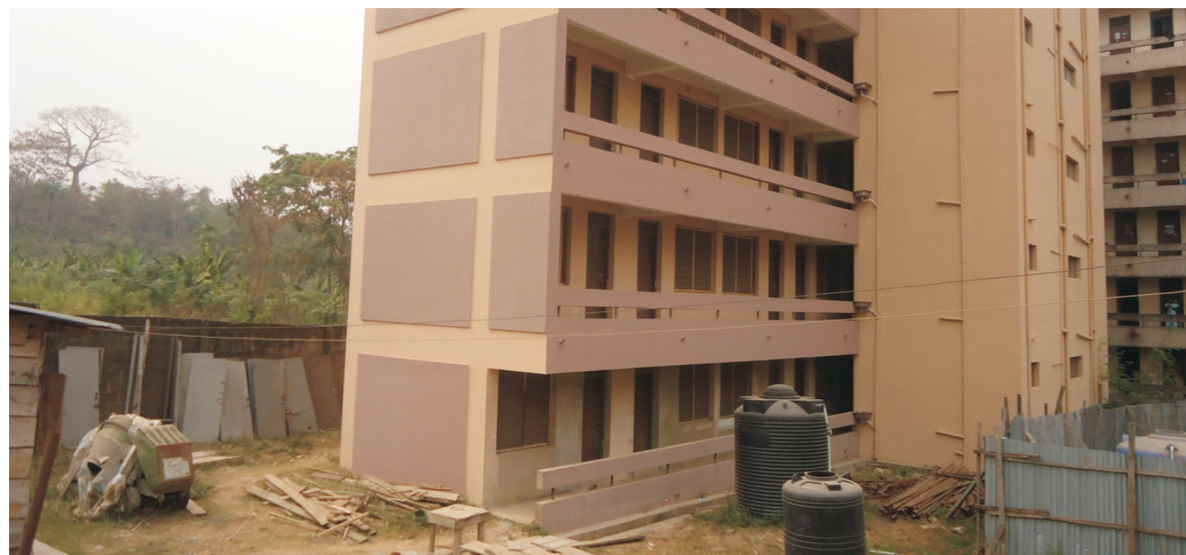
RESTRUCTURING OF OBAFEMI AWOLOWO HALL BLOCK I

Contractor - In-Depth Associate Contract Sum - N 113,803,008.79 Amount Paid - N 107,294,786.62 % Payment - 94.28 Date of Award - October, 2015 Completion Period - 24 weeks Expected Completion Date - April, 2016 % Completion - 100% Progress Report - Completion