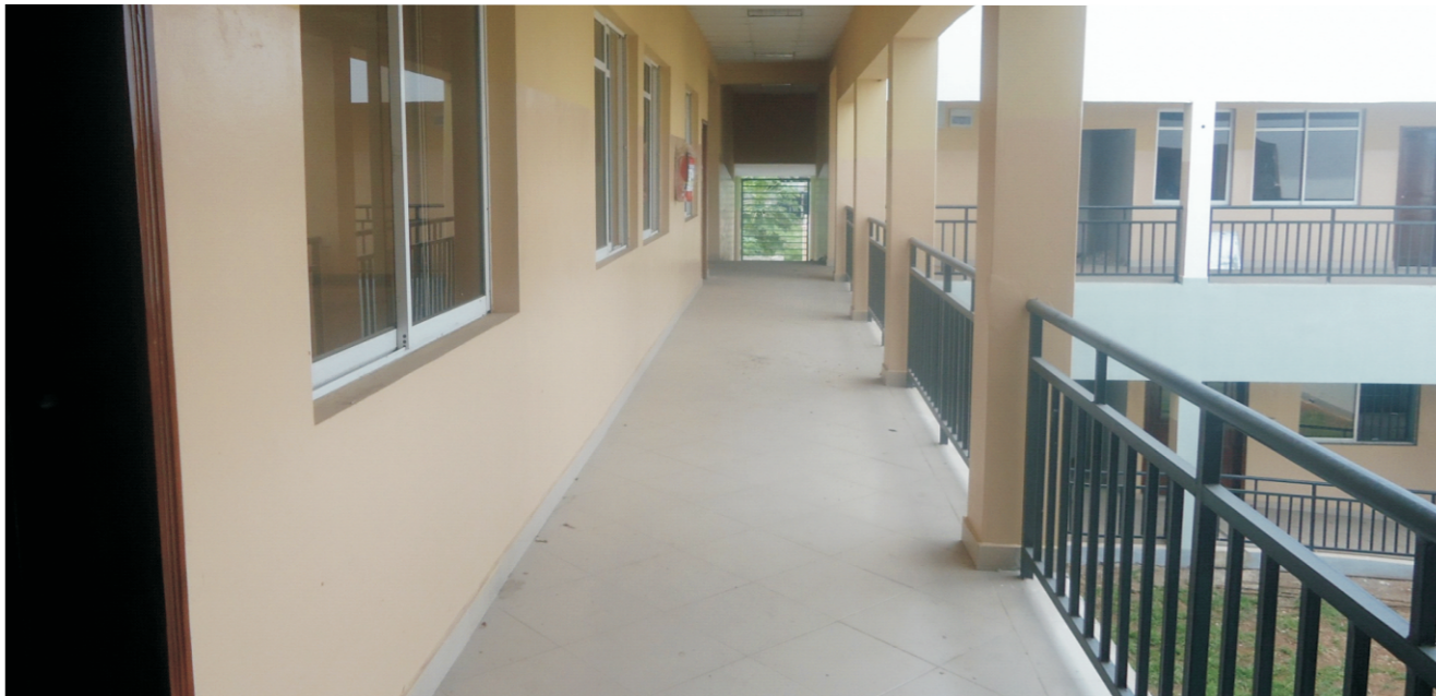
NEWLY BUILT CENTRE FOR EDUCATIONAL MEDIA RESOURCE CENTRE

Construction of Centre for Educational Media Resource Centre Contractor - Snow Trust Ltd Contract Sum - N 155,000,000.00 Amount Paid - N 143,527,037.89 % Payment - 92.60 Date of Award - 14/01/2015 Completion Period - 12 weeks Commencement Date - February, 2015 Expected Completion Date - May, 2015 Progress Report - Completed, % Completion - 100%