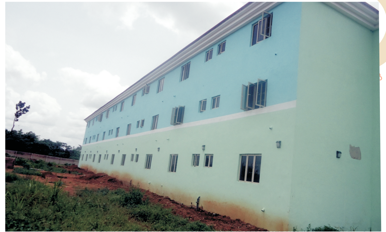
NEWLY BUILT UNIVERSITY ALUMNI POSTGRADUATE HALL