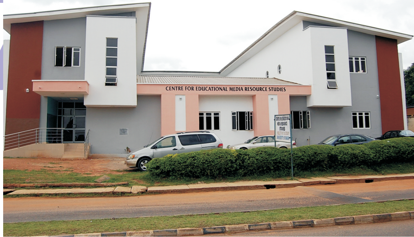
NEWLY BUILT CENTRE FOR EDUCATIONAL MEDIA RESOURCE CENTRE

Construction of Centre for Educational Media Resource Centre Contractor - Snow Trust Ltd Contract Sum - N 155,000,000.00 Amount Paid - N 143,527,037.89 % Payment - 92.60 Date of Award - 14/01/2015 Completion Period - 12 weeks Commencement Date - February, 2015 Expected Completion Date - May, 2015 Progress Report - Completed, % Completion - 100%