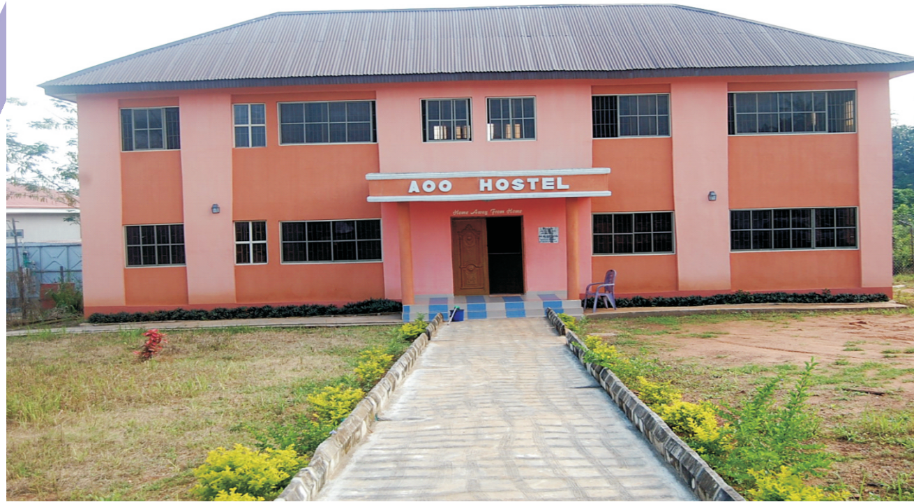
NEWLY BUILT AOO PRIVATE HOSTEL BUILDING