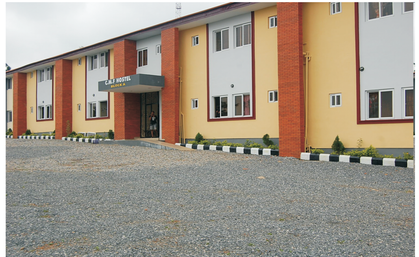
NEWLY BUILT CMF PRIVATE HOSTEL BUILDING