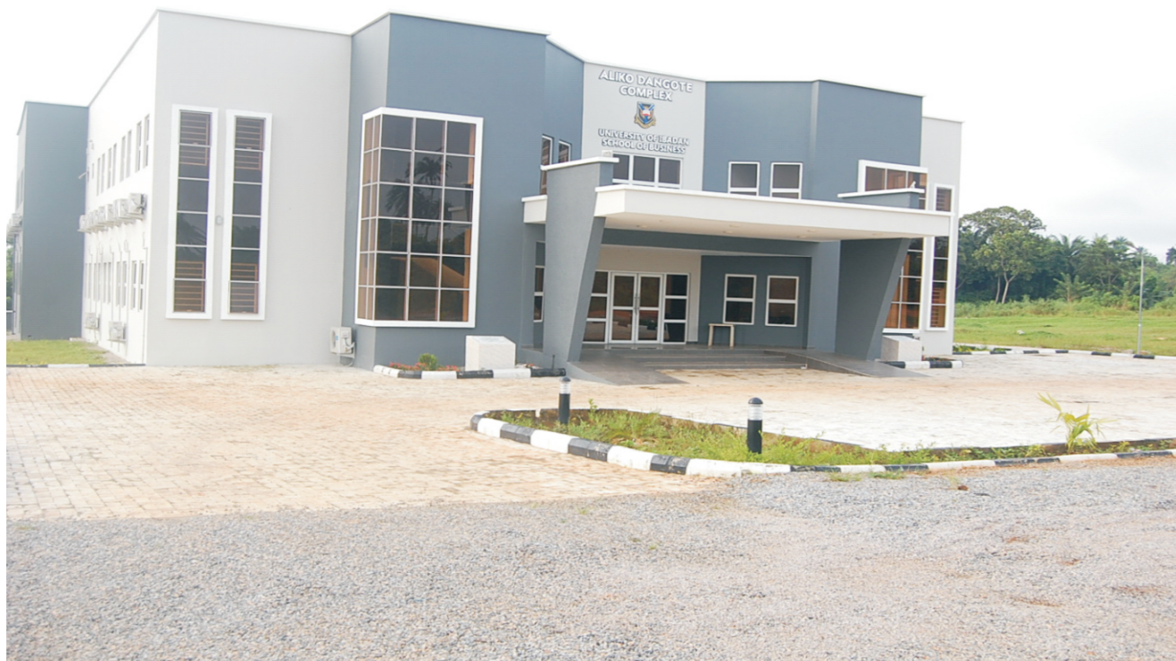
NEWLY BUILT ALIKO DANGOTE COMPLEX UI SCHOOL OF BUSINESS