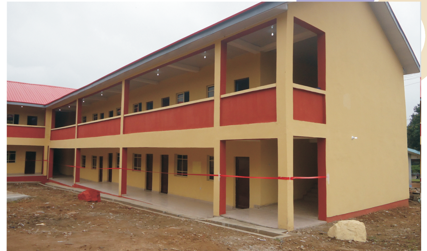
NEWLY BUILT BODE AMOO CRECHE/NURSERY SCHOOL BUILDING