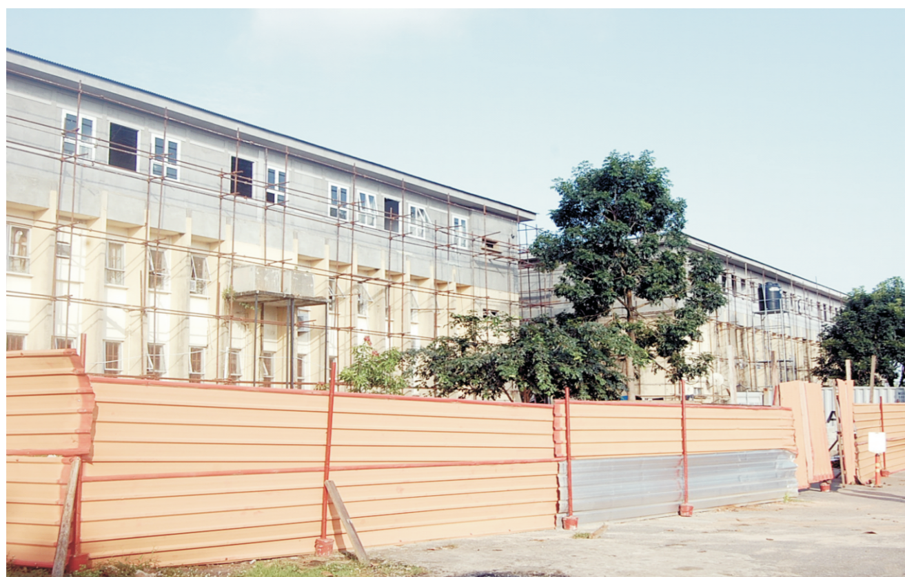
VERTICAL EXTENSION OF PHYSIOLOGY BUILDING

UNIVERSITY OF IBADAN Total Fund released to UI == 5,280,666,666.70 1st Tranche in 2014 == 2,933,703,703.81 2nd Tranche in 2016= 2,346,962,962.89