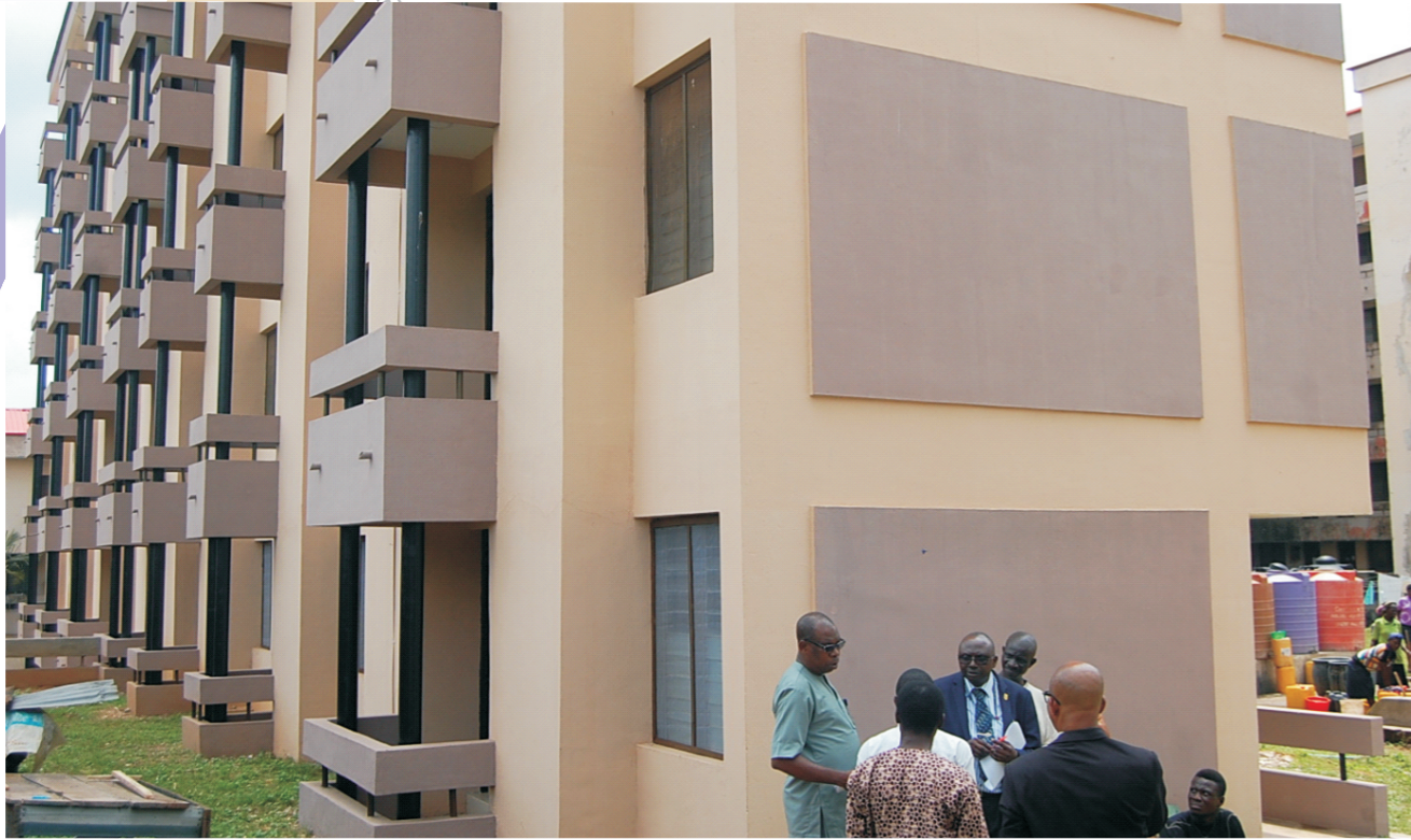
OBAFEMI AWOLOWO HALL BLOCK I