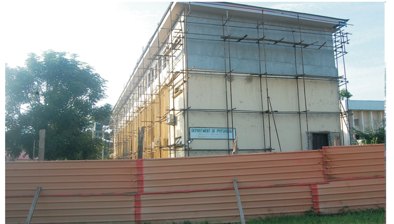
VERTICAL EXTENSION OF PHYSIOLOGY BUILDING