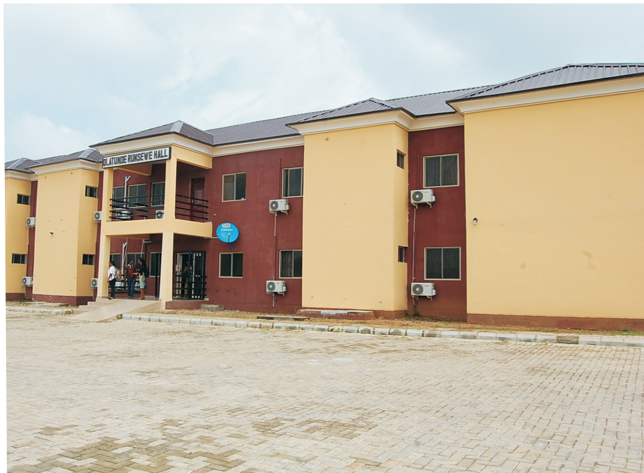
NEWLY BUILT OLATUNDE RUNSEWE PRIVATE HOSTEL BUILDING