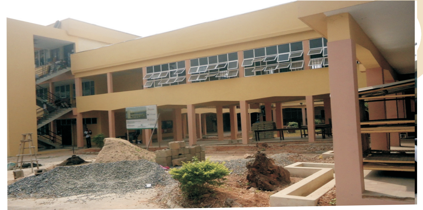
EXTENSION OF FACULTY OF TECHNOLOGY BUILDING & CREATION OF EXIT STAIR CASE