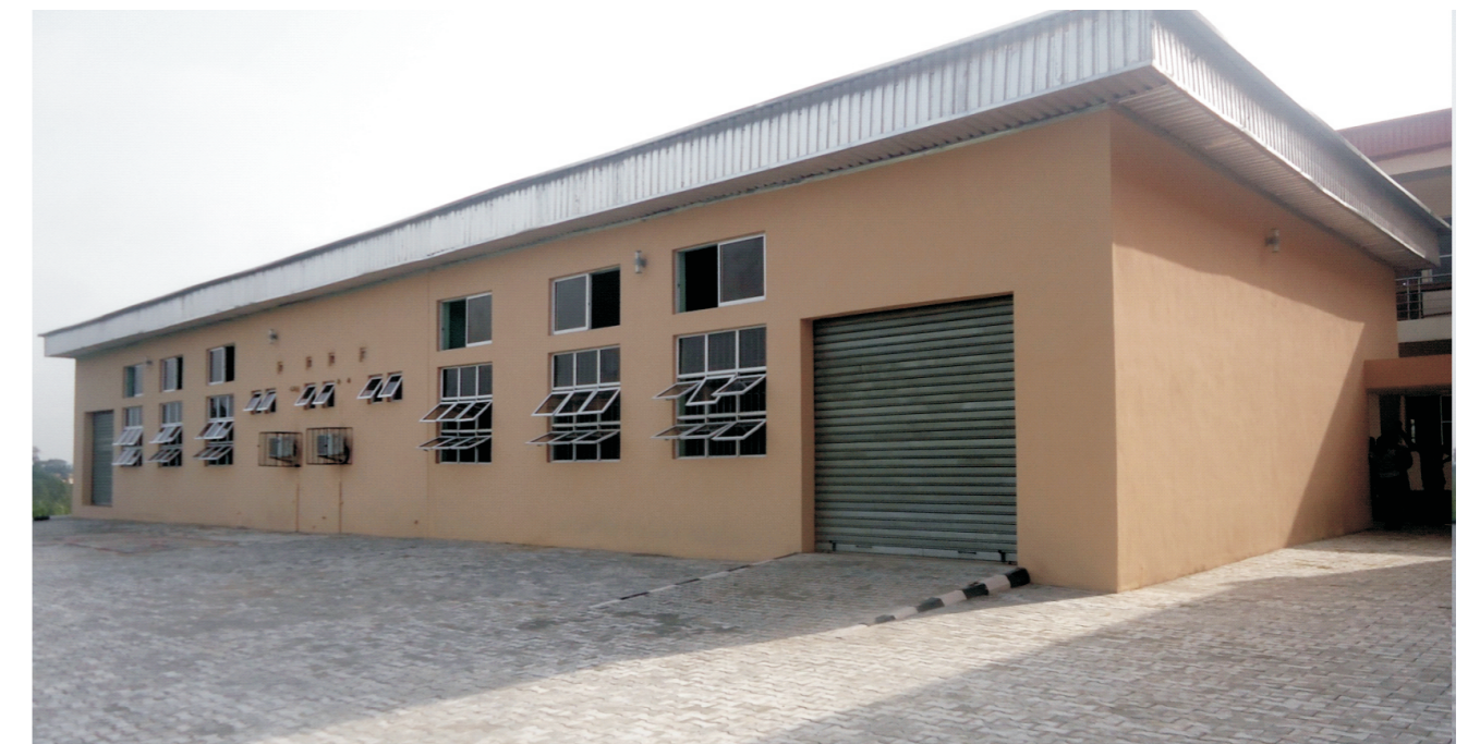
EXTENDED FACULTY BUILDING: TECHNOLOGY (BACK VIEW)

Contractor - Lanre- Niran Ltd. Contract Sum - N 109,856,488.16 Amount Paid - N 106,821,647.07 % Payment - 92.53 Date of Award - 01/09/2015 Completion Period - 28 weeks Expected Completion Date - 31/05/2016 % Completion - 100% Progress Report - Completed