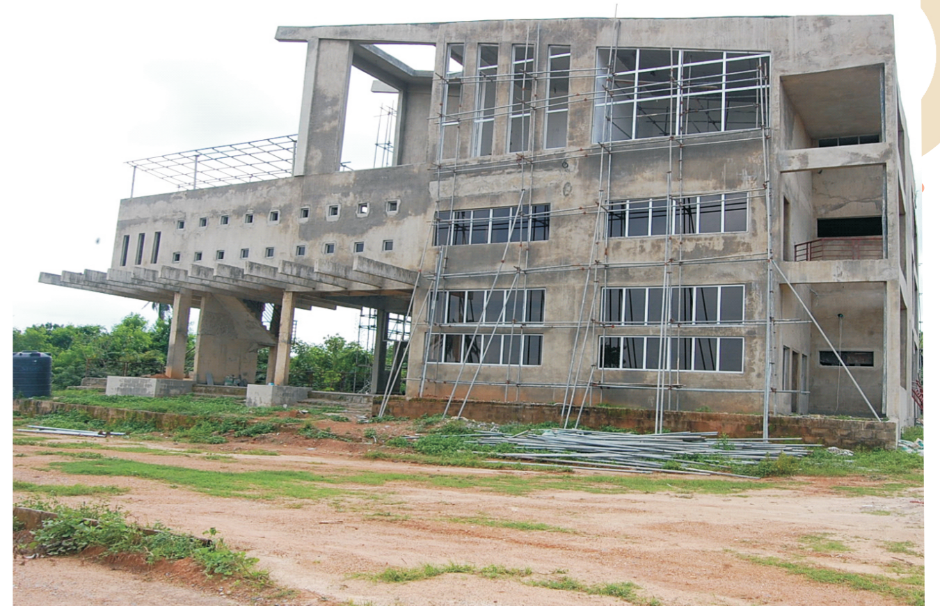
ONGOING CONSTRUCTION BUILDING, RESEARCH FOUNDATION UI