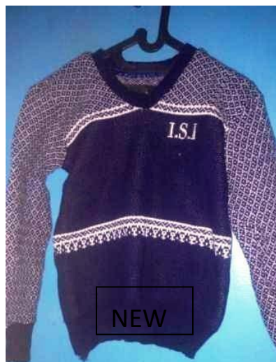
Above are the recommended cardigans to be worn in school by students.